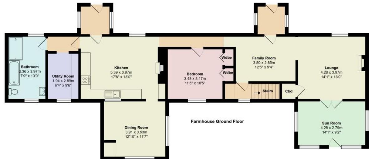
Farmhouse Ground Floor