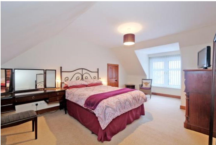
Mill of Kingoodie